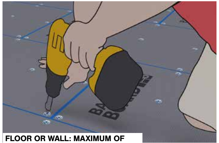
FLOOR OR WALL: MAXIMUM OF 300MM BETWEEN FIXING CENTRES

10: Tile & Stone Flooring. All tiles can now be fitted directly over the insulation. A suitable flexible tile adhesive should be used as directed by the adhesive